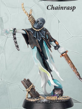
The Ever-hanged (Chainrasp)