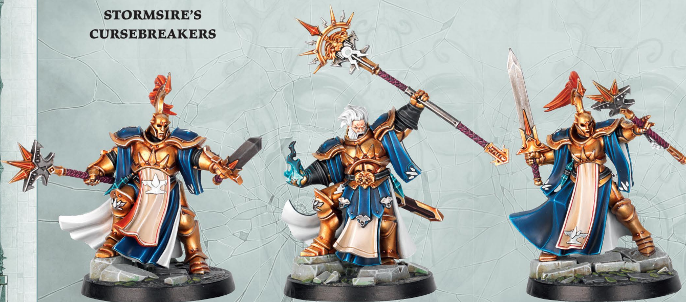
Rastus the Charmed